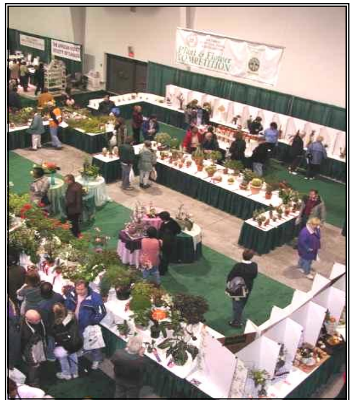
The OHA Plant & Floral Competition at a previous Success with Gardening Show (now renamed Successful Gardening ).